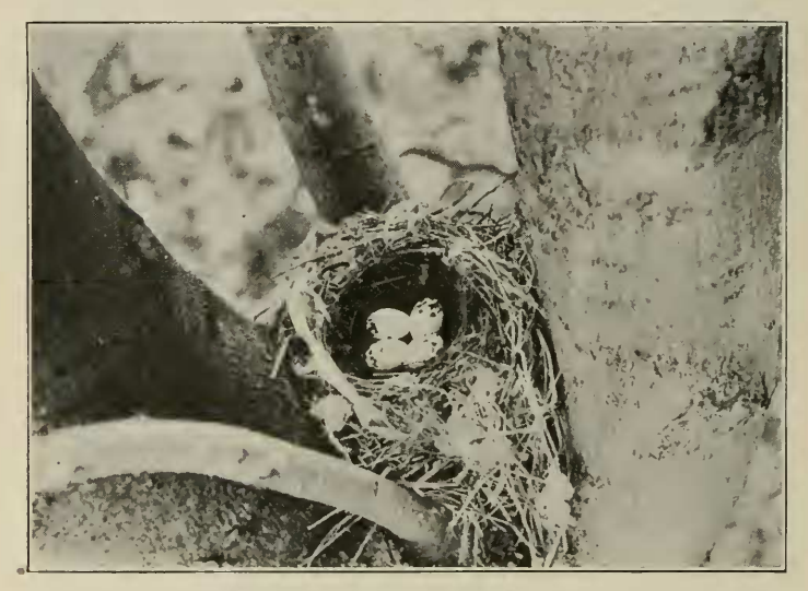
NEST AND EGGS OF KINGBIRD

11. Steganopus tricolor. Wilson's Phalarope. I have no definite breeding record for this species, but a pair remained all through June